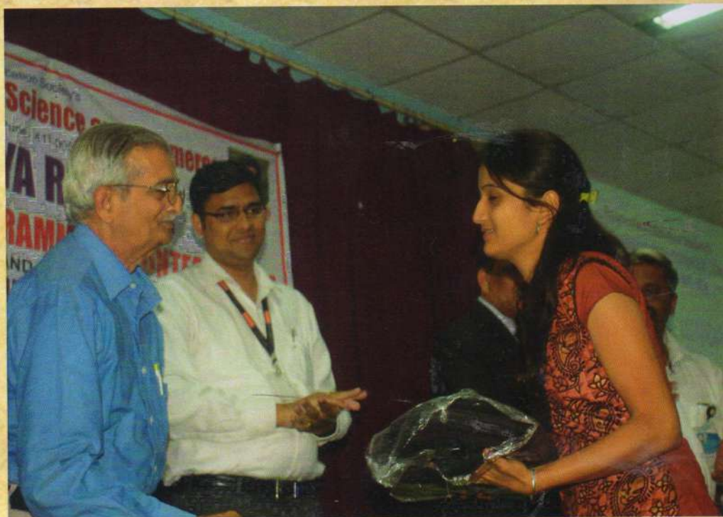
Recipients of Kartikeya Rindani Scholarship