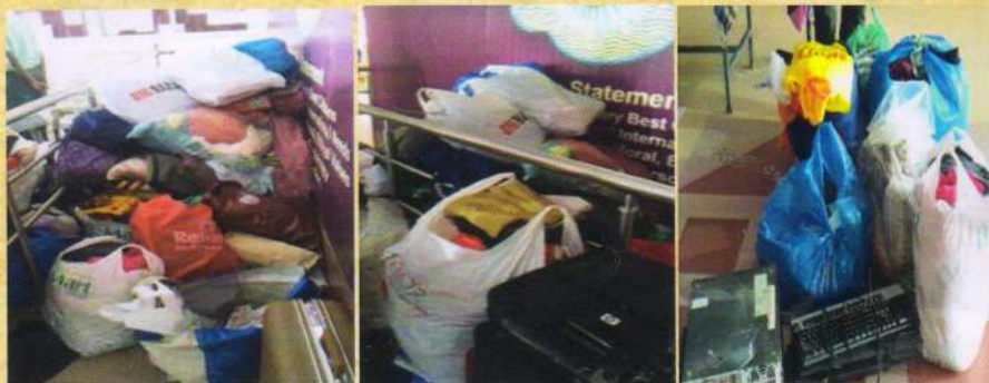
Overwhelming response to the old cloth collection drive