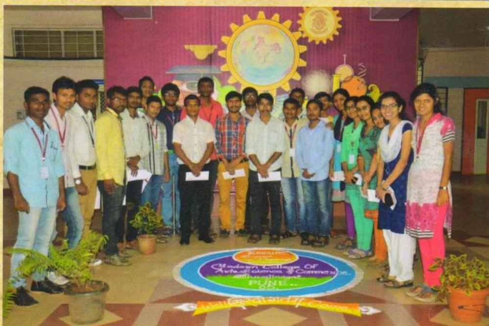
Awardees of financial assistance from EmcurePharmaceuticals Pvt. Ltd.