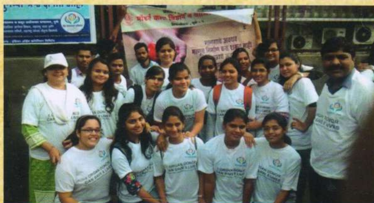
M.Sc. (Zoology) students as participants in Mega Rally for Organ Donation

Excited students participated in the mega awareness program with 10,000 individuals, all dressed in white t-shirts and caps with the imprinting- "1 donor can save 8 lives". Students were provided with the same by the organizers.