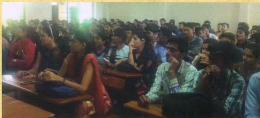
Audience in rapt attention at organ donation awareness lecture