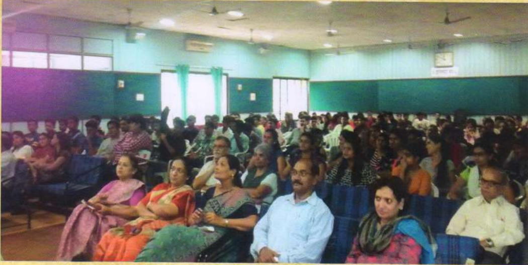
Audience at Skin Donation Lecture

In case of smaller percentage of burns, skin from the unburnt area of the patient is cut and put on the burn/wound to cover it. But when a person has more than 40% to 50% burns, then the patient's skin cannot be used. In such a scenario, skin substitutes (donor) is required.