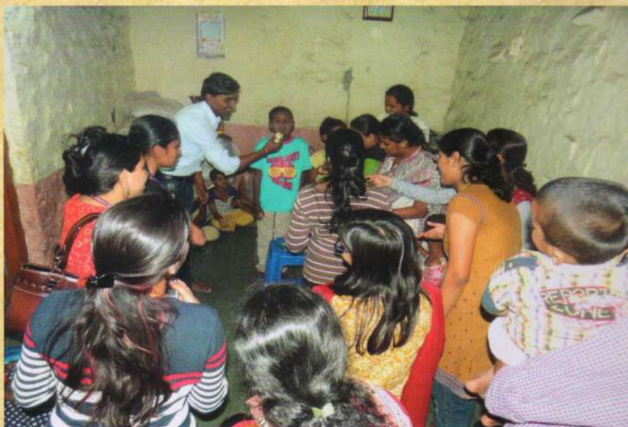
Activities conducted by Microbiology Dept. for the children