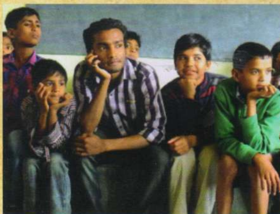
Taare Jameen Par