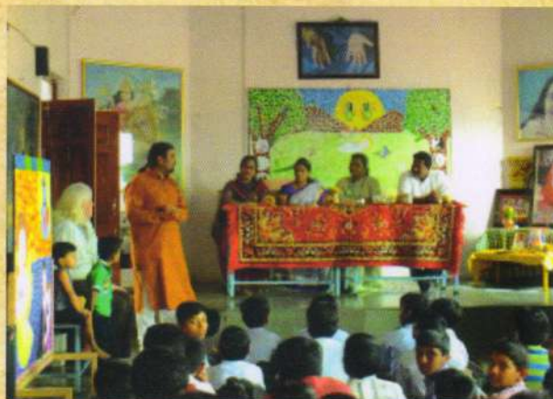
The felicitation Programme

Institute of Science Bangalore. Their work was well received and recognized internationally and the students interacted with researchers of international repute. This was a huge achievement and probably rare in India where students perform at such a level.