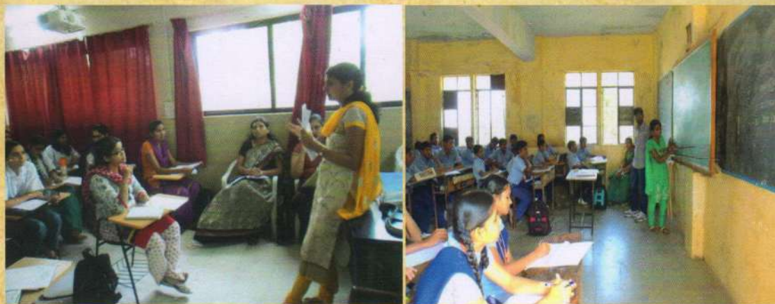
Career Awareness Counseling Camp

Counseling camps were conducted for various problems of the students of various age groups of neighborhood community. (School, Police line society, colleges).