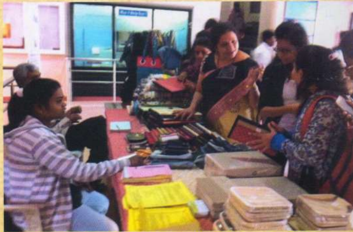
Exchanging old clothes with eco-friendly articles

We ensured the dignity by providing them respect & human touch, through empathetically approach. In this drive, we provided clothes, stationary items, toys, story books, etc to the underprivileged people living in open on the streets and in slum areas in Pune. In addition to said items, e-waste was also collected for systematic recycling.