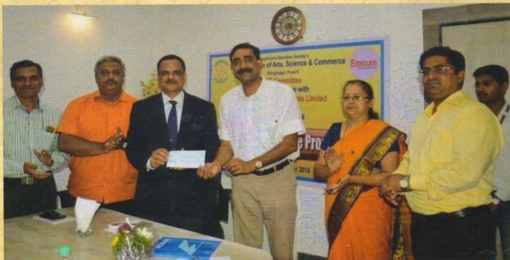
Presenting Cheque for financial assistance to the Principal