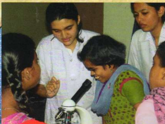
Microbiologists explaining the importance of Hygiene