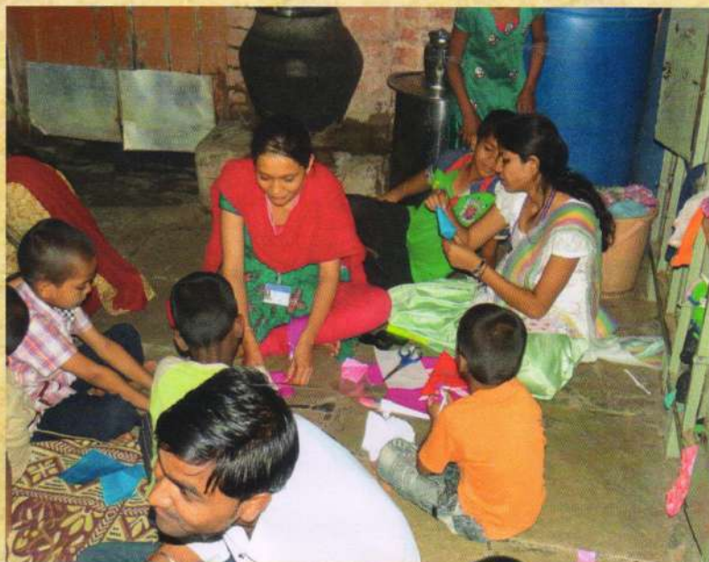
Activities conducted by Microbiology Dept. for the children

M. Sc. II students visited to the site and had arranged games for the children. Students distributed accessories like earrings, nail paint, rubber bands etc. Students played games with children like treasure hunt, Volley ball and cricket. Various activities have been conducted like drawing, craft which were helpful for them. Children have mostly enjoyed activities like mehendi and dance. Students made Bhel as a part of their evening snack and entertained the children for the whole day.