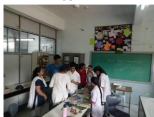
Day 2: Practical session for isolation and characterization of DNA