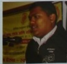
Youth express their views

Moments captured by Shri Prakash Sabale (Office Staff)