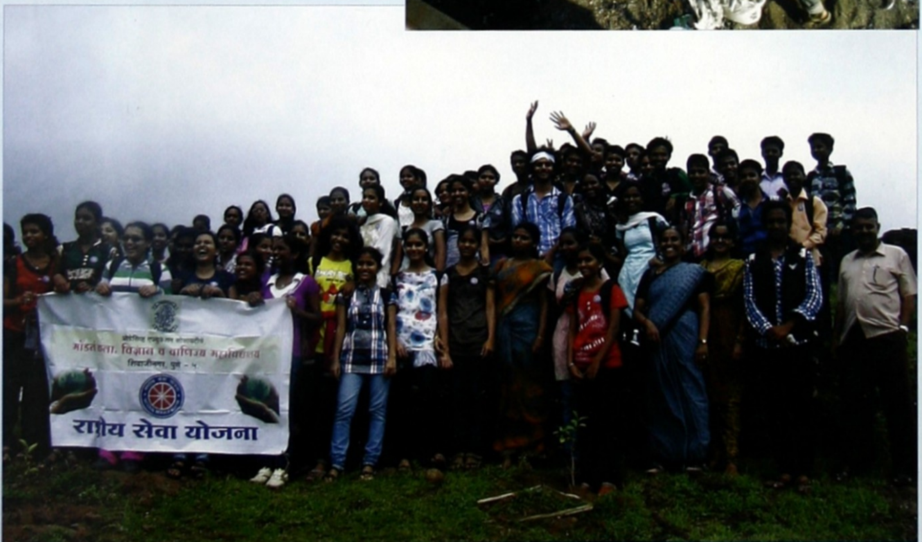
Student volunteers and Programme Officers at Shramasanskar Shibir, Phulgaon.