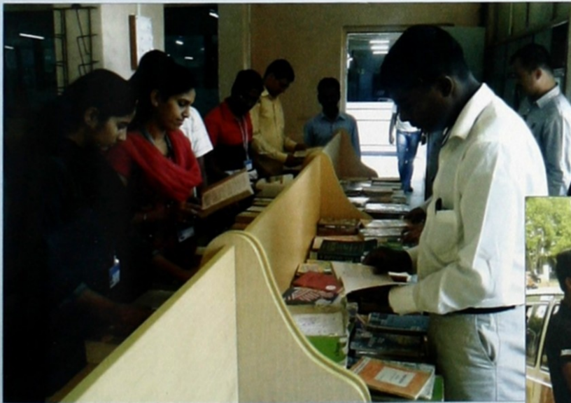
Library: Sale of Old Books