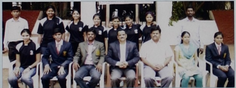
2nd Place. Intercollegiate Volleyball (W)