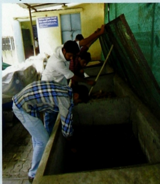
Science Students of the Earn and Learn Scheme monitoring the Vermicompost Unit of our college.