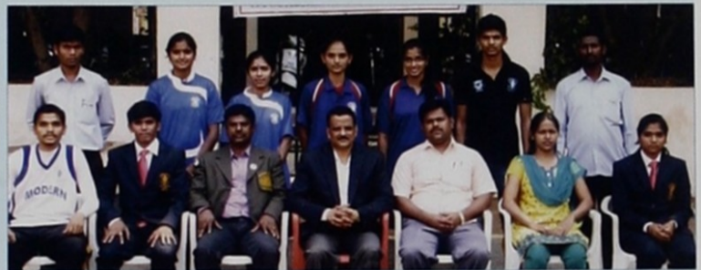
2nd Place. Intercollegiate Netball Competition