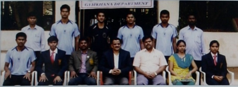
2nd Place. Intercollegiate Handball (M)