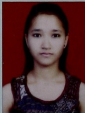
Neggi Bina Kickboxing National-Bronze