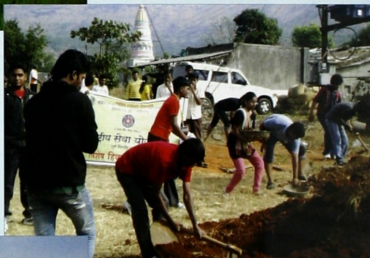
Shramadaan during Special Camp at Kule, Taluka Mulshi.