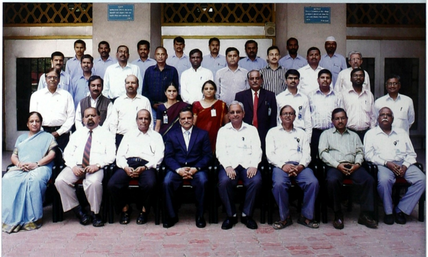
Science Faculty Teaching and Non-teaching staff - Senior and PG