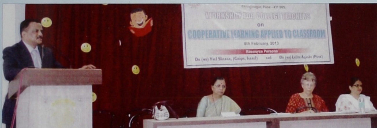
A workshop on cooperative learning.