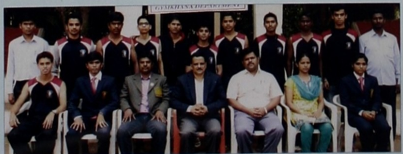
3rd Place. Intercollegiate Kho-Kho (M)