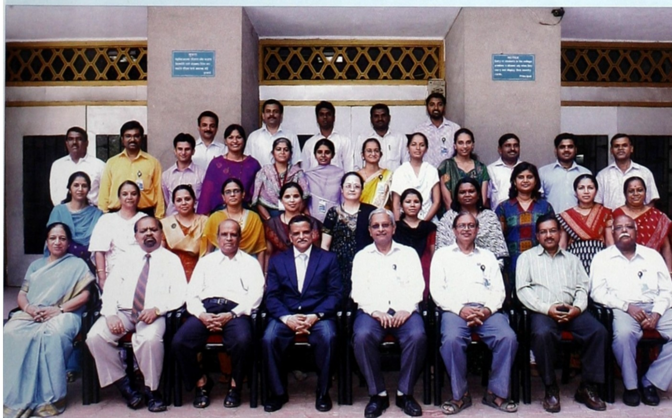
Science Faculty Teaching and Non-teaching staff - Senior and PG