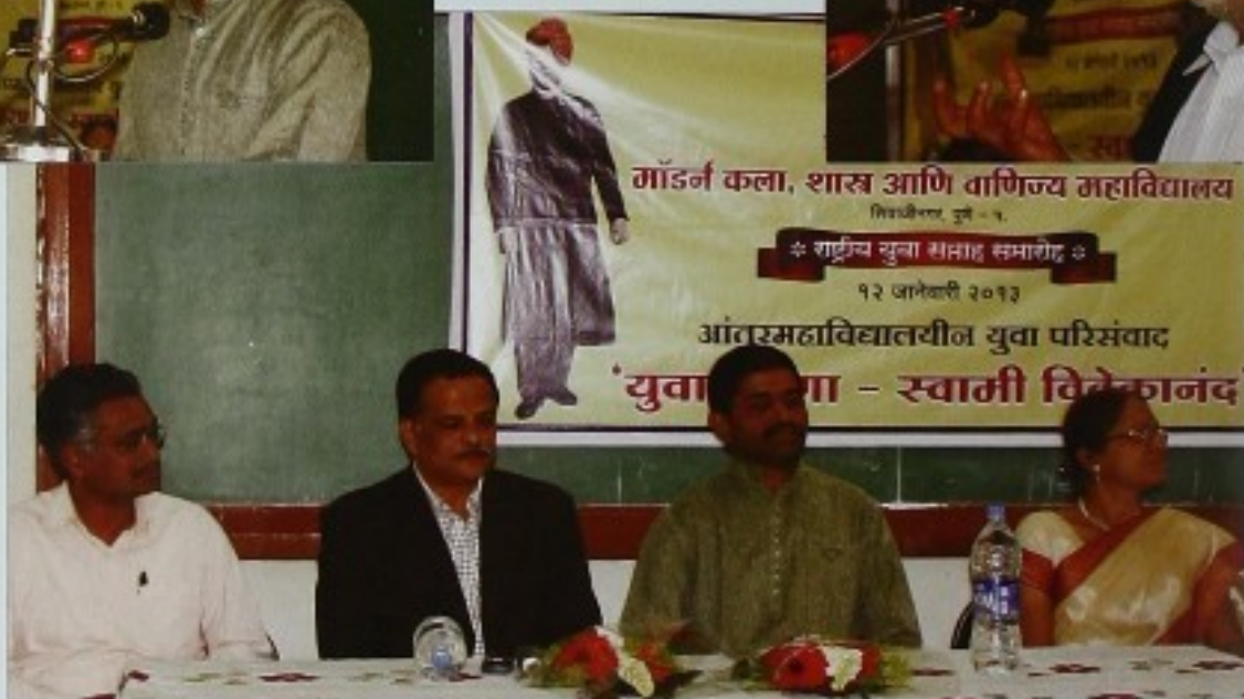
Inaugural session Youth inspiration : Swami Vivekananda