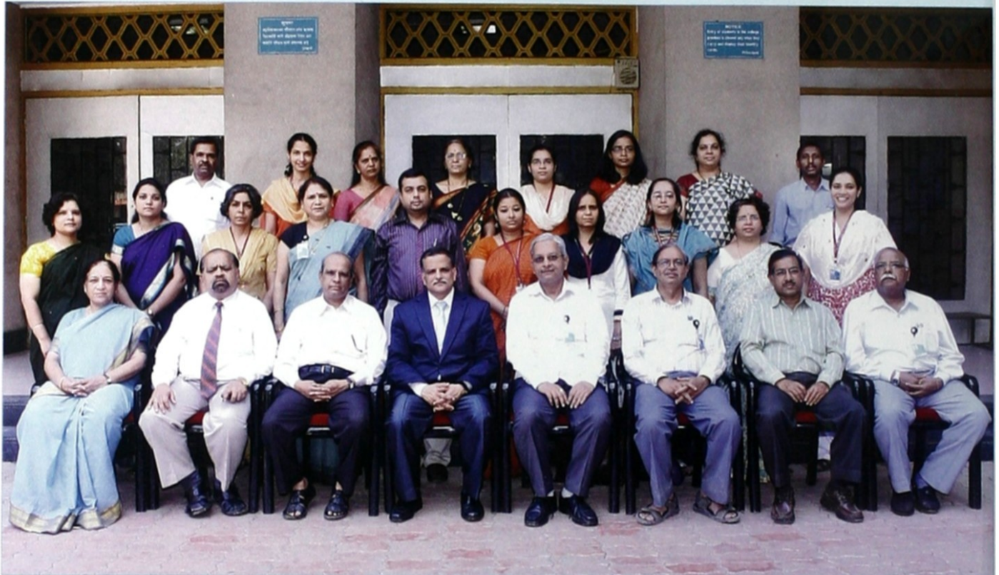
Arts Faculty Teaching and Non-teaching staff - Senior and PG