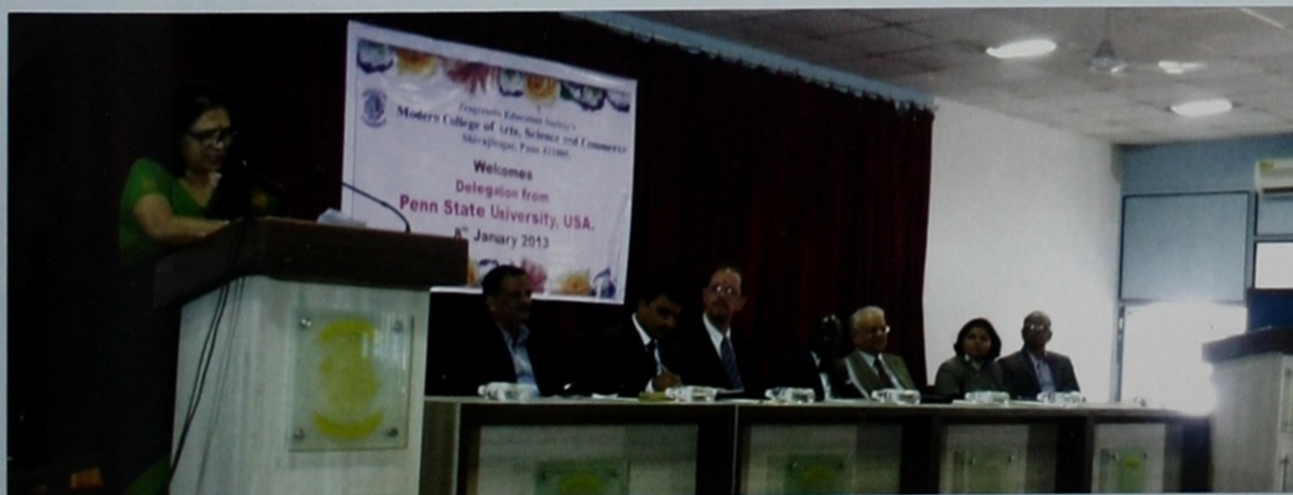
Foreign Delegation from Penn State University, U.S.A. - Interaction with faculty members of our college.