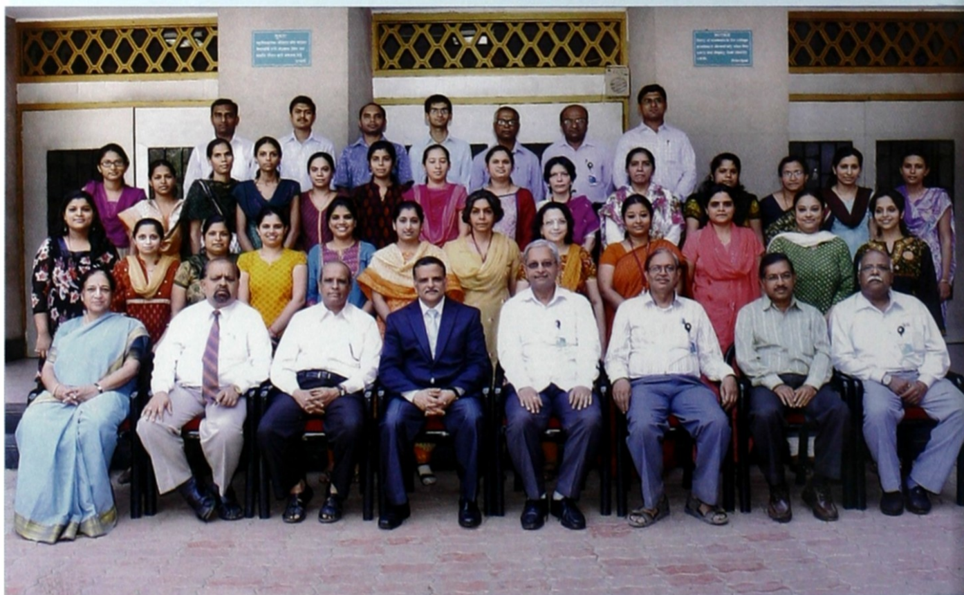
Commerce Faculty Teaching and Non-teaching staff - Senior and PG