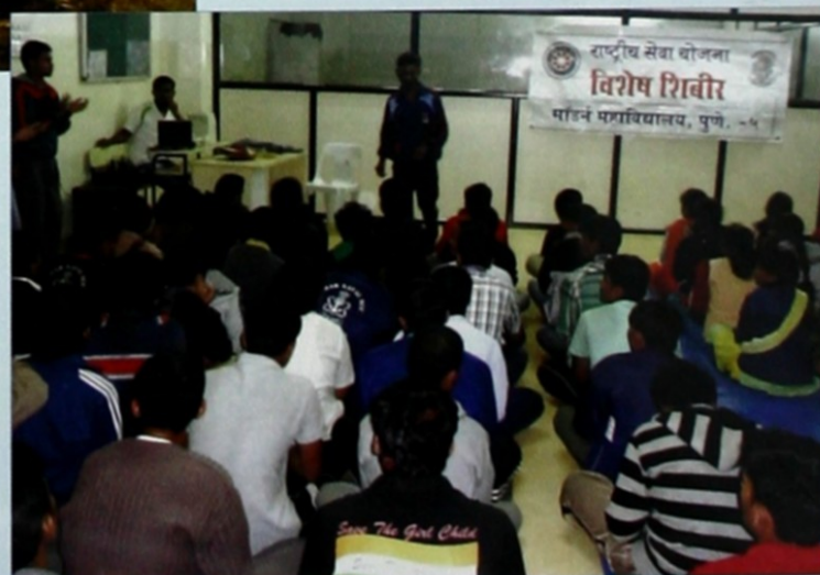
Talk by NSS volunteers at Kule, Taluka Mulshi, for school children.