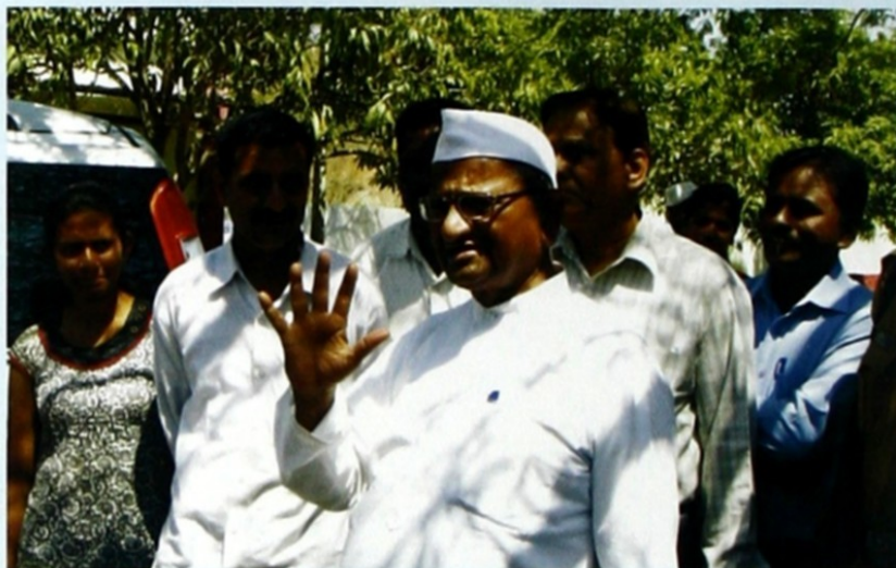
F.Y.B.Sc. Students - Visit to Ralegan Siddhi - Social Reformer Anna Hazare speaks to our 'Modern' Youth.