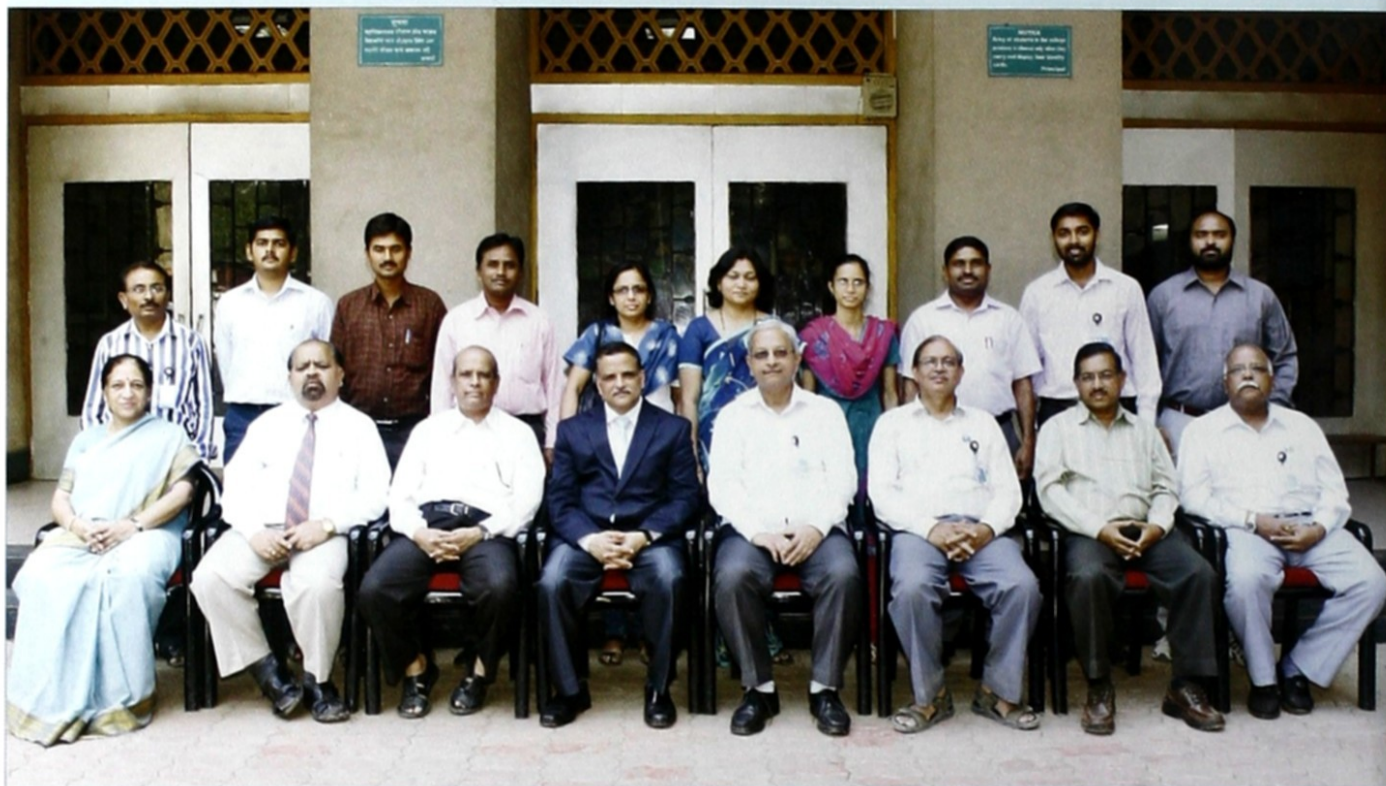
Science Faculty Teaching staff - Senior and PG