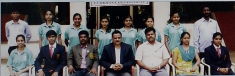
2nd Place. Intercollegiate Kho Kho (W)