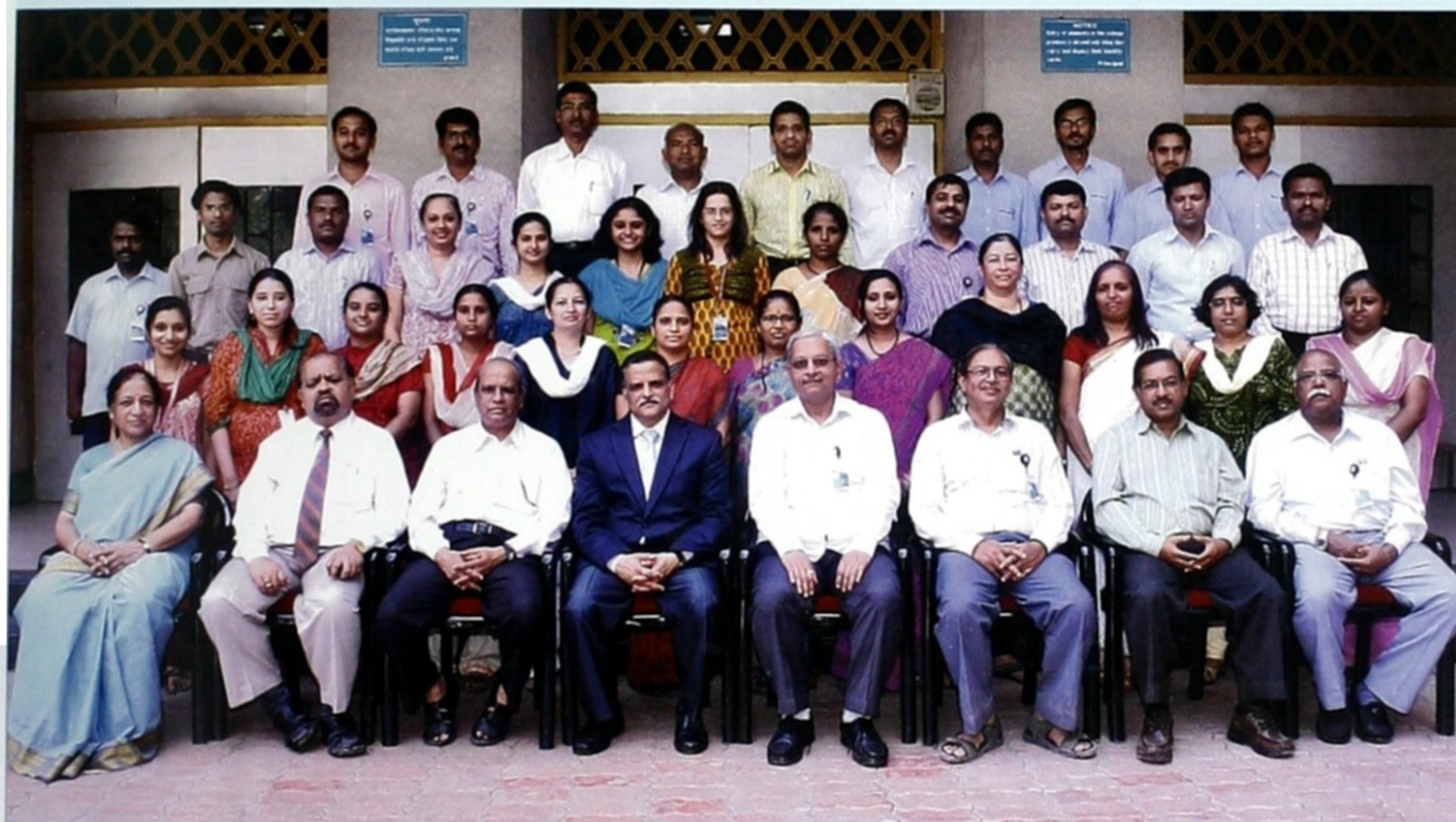
Science Faculty Teaching and Non-teaching staff - Senior and PG