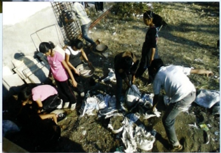
"Hands at Work" at the NSS Camp