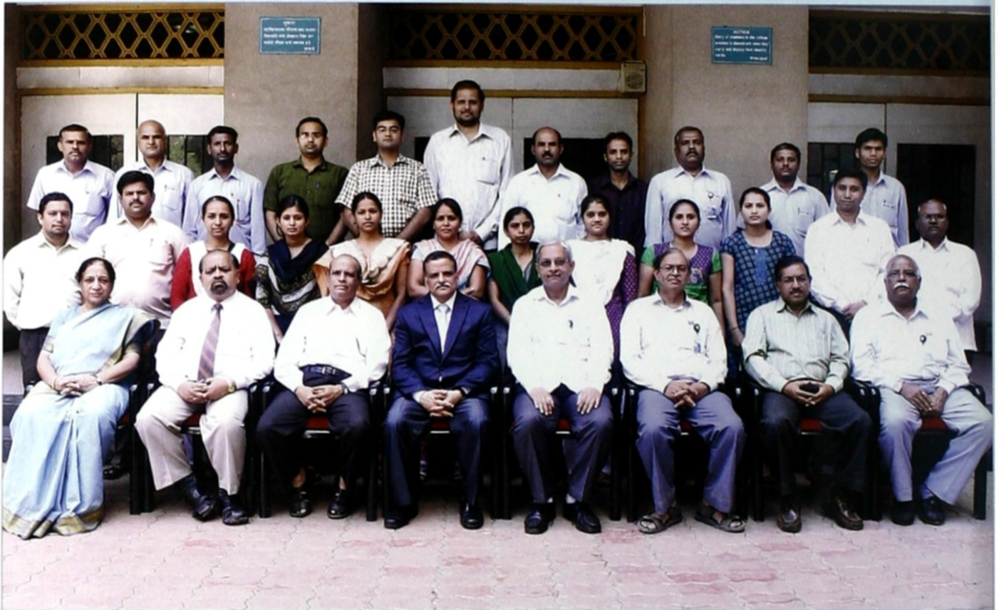
Library and Gymkhana