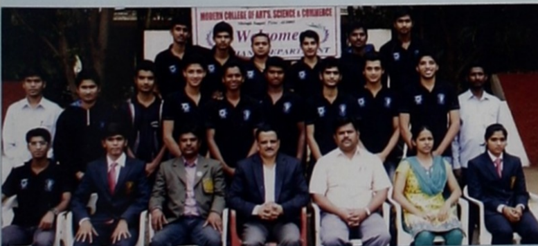
3rd Place. Intercollegiate Baseball (M)